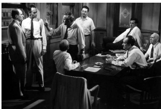
A scene from the 1957 film "12 Angry Men," starring Henry Fonda.